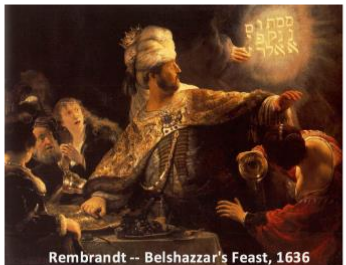
Rembrandt -- Belshazzar's Feast, 1636

The “ Handwriting on the wall ” would certainly be a good phrase to describe the END OF THE WORLD! God has been “writing on the wall” to warn us that Judgment Day is coming and that you must be ready. The “ handwriting on the wall ” is