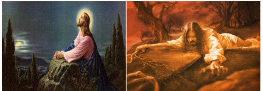
Which picture better describes Jesus in the Garden of Gethsemane?

In the Garden of Gethsemane , Jesus is in